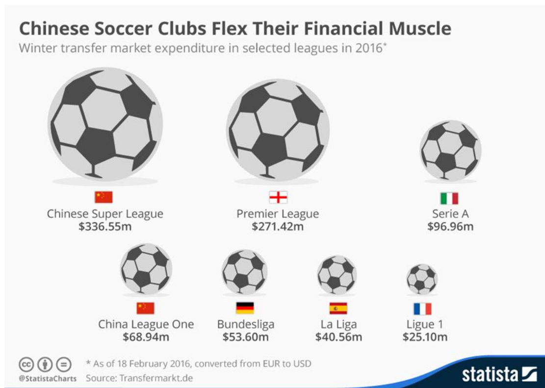
Picture 1. Money spent during Winter Transfer Window 2016.