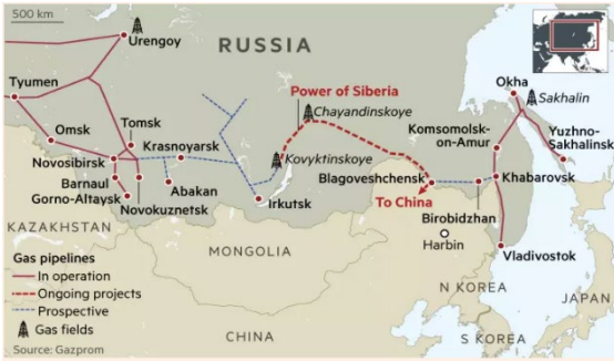
Figure 3. The Power of Serbia Oil & Gas Pipeline Route