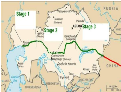
Figure 5. China-Pakistan gas and oil pipeline