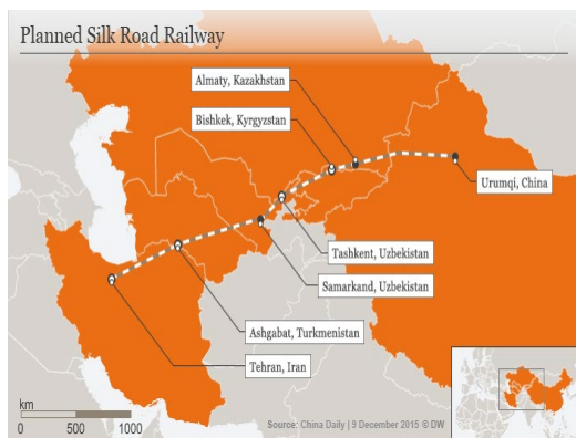
Figure 2. Urumqi-Taheeran Railway