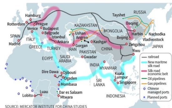
Figure 1. Belt & Road Initiative Projection Map.

collaboration, funding, to cross-cultural cooperation.