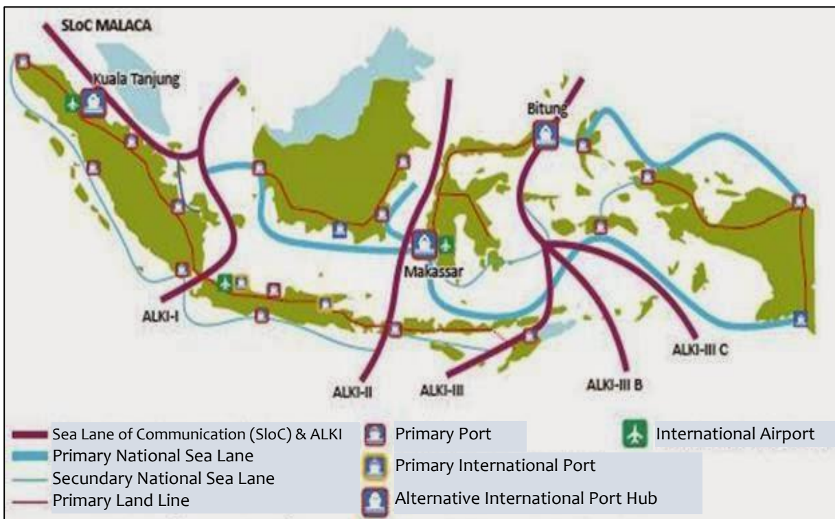
Figure 1. ALKI I Route

a component that plays a role in supporting KRI or Elements, the base needs to be well-equipped, in accordance with international standard, as a requirement for an ideal base. The Bangka Belitung Naval Base is one of the components of SSAT (Integrated Naval Weapon System), which belongs to the Komando Lantamal III Jakarta. Currently, the Bangka Belitung Naval Base consists of 4 (four) naval posts (Posal), namely Pangkal Balam Posal, Muntok Posal, Tanjung Pandan/Mendanau Posal and Manggar Posal. 4