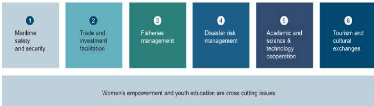
Figure 3. Six Priority Areas of IORA