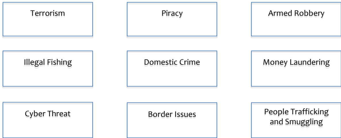
Figure 4. Domestic Issues on Security