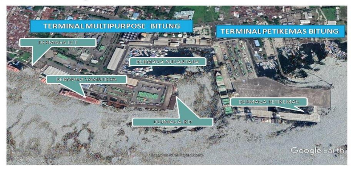
Figure 2. Bitung Port Layout

of the four port infrastructure would be in line with BRI's "strategy". So it can be said, mastery of SLOC and international shipping routes at ALKI I, ALKI II and ALKI III is a real challenge for Indonesia's geostrategy. Thus, the assumption in geostrategy and geopolitics is as follows: "Those who are able to master the Sealane of Communication (SLOC) will determine the achievement of national interests. On the other hand, disruption of SLOC security will result in uncertain situation". This is what Indonesia must maximize in order to take advantage of geopolitical and geo-strategic space, to measure all forms of threats and potential conflicts that can occur unexpectedly. The implication of this research is that the constellation of the Chinese BRI pathway and maritime policies in Indonesia are not