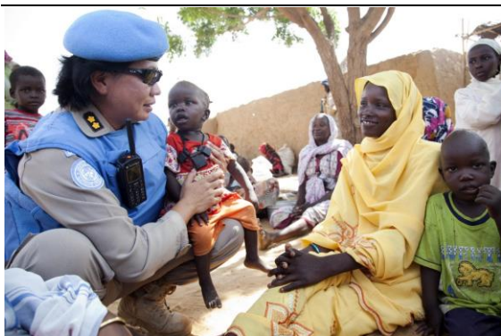
Figure 1. Indonesia's female peacekeepers when interacting with local society