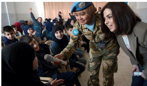
Figure 2. Indonesia's female peacekeeper s is conducting a program to disseminate the danger of UN Blue Line