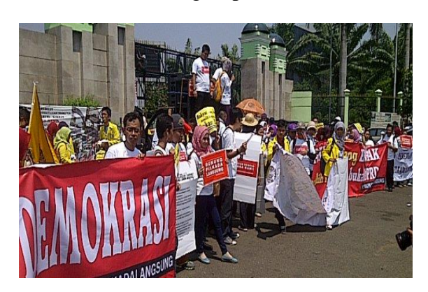
Figure 1 . Mass Demonstration to Reject DPRD Regional Election

Political escalation towards provincial elections and the Presidential Election became a spectacle of an elitist for power struggle drama. The elite political that dominate in the scene of state politics illustrate the style of leaders who are hungry for power. Strong political activities such as the mass base, the ability to mobilize politics, money, and influence are important keys to smoothing and defending the throne of power. Power is no longer based on the interests to achieve the welfare of wider community; it is more of greed in order to maintain the reins of leadership and prioritize the interests of the political elite and their own groups or class.