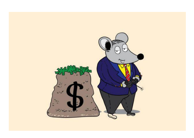
Figure 3 . Rats and corruption

the metaphor into three parts, such as (1) the object or thing discussed, (2) the image, the metaphorical part of the universe used to describe the topic in the context of comparison, and (3) similarity point, which is the part that shows similarities between the topic and the image.