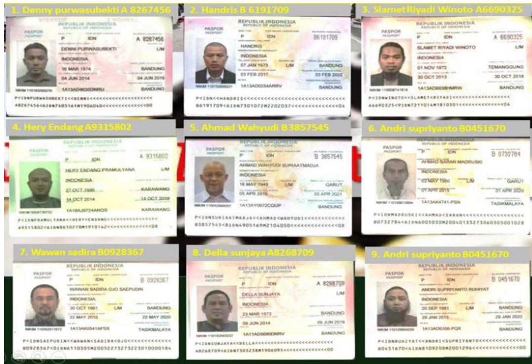
Figure 2. Indonesian FTF involved in Marawi Incident

become a world khilafah and an invitation to join and jihad with ISIS (Dewi, 2018).