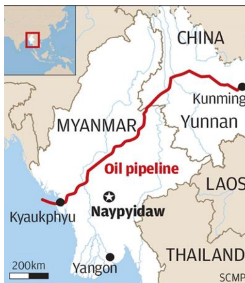
Figure 3. China-Myanmar Economic Corridor