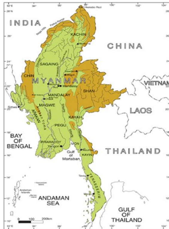
Figure 1. Myanmar Map