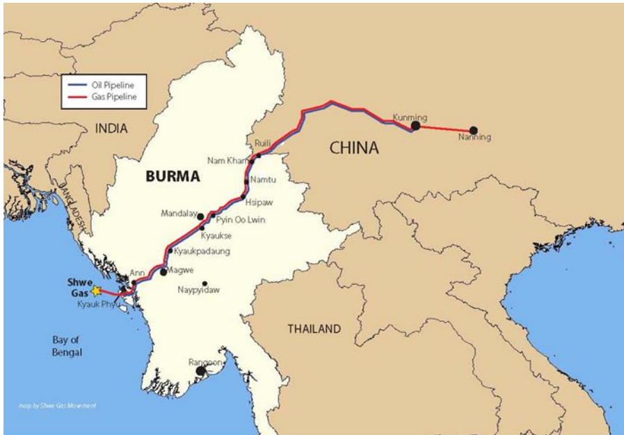
Figure 4. Gas Pipeline from Myanmar to China, 2011