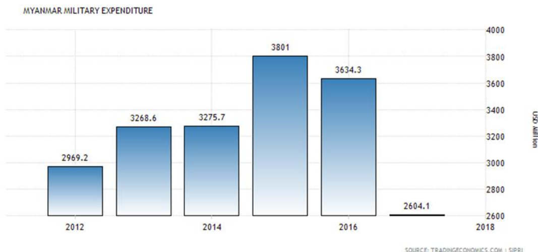
Figure 6. Myanmar Military Expenditure

Myanmar military expenditures has been fluctuating from 2012 to 2013, the amount increased to 3268.6 USD Million and increased to 3801 USD Million in 2015. Meanwhile in 2016 and 2017, the total expenditure of Myanmar decreased to 3634.3 USD Million in 2016 and 2604.1 USD million in 2017. According to The National Defense and Security Council, one of factors which affected Myanmar military expenditure is to deal with the rebel group (Pike, 2015). As in 2014, Myanmar with its military powerful voice in parliament, has spent 23.2 percent of its national budget on military expenditure against the rebel group.