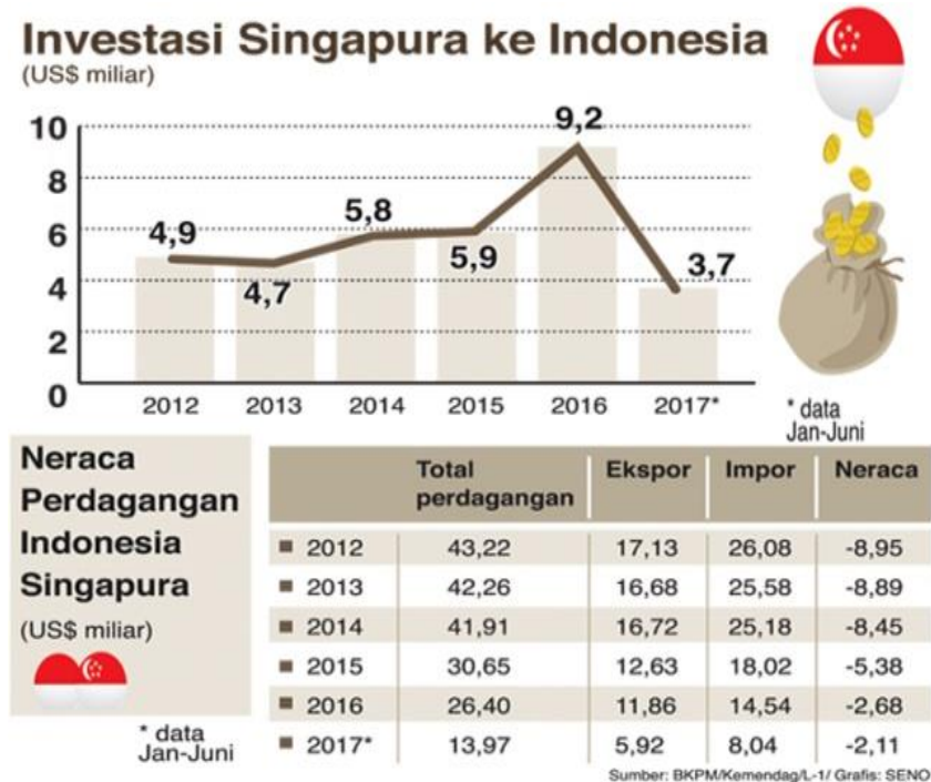
Figure 1. Singapore's Investment to Indonesia