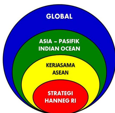
Figure 2. Concentric Defense

This is due to the strong interdependency between nations in the world in the field of security, economy and politics. The main purpose is to build a “concentric defense” with countries around Indonesia, in the region to the world, as shown below.