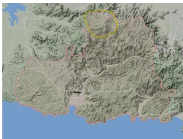
Figure 3. Topographic Map of Sobo Hamlet (Saputra, 2021)

Another remote village famous in the history of General Soedirman's guerrilla terrain is Sobo Hamlet, this hamlet is located in Pacitan, the hamlet provides a hiding place with a position behind steep cliffs, hills, rocks, and pine trees, making it very impossible to be tracked by Dutch planes (Soewarno, 1985). The area around the Hamlet is shown in Figure 3.