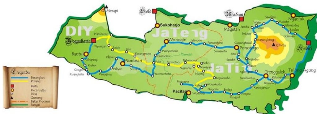
Figure 2. General Soedirman's Guerrilla Route (Saputra, 2021)

The routes across those areas demonstrated the ability to take natural advantage of geographical characteristics involving the topography of diverse terrain. General Soedirman's route from start to finish determined how geography influenced his military strategy decisions, including choosing villages or areas to serve as military headquarters, communication lines, and guerrilla troops' protection. General Soedirman did not think about his safety because the most important thing for him was the safety of his troops. So, he provided maximum protection for his troops while continuing to launch effective guerrilla attacks by choosing places that were difficult for the enemy to reach. Geographically, the route of the area traversed by General Soedirman's troops was a land defense dominated by villages, rivers, and mountains as seen in Figure 2.