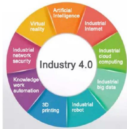
Figure 2. Technological Disruption in the Industrial Revolution 4.0